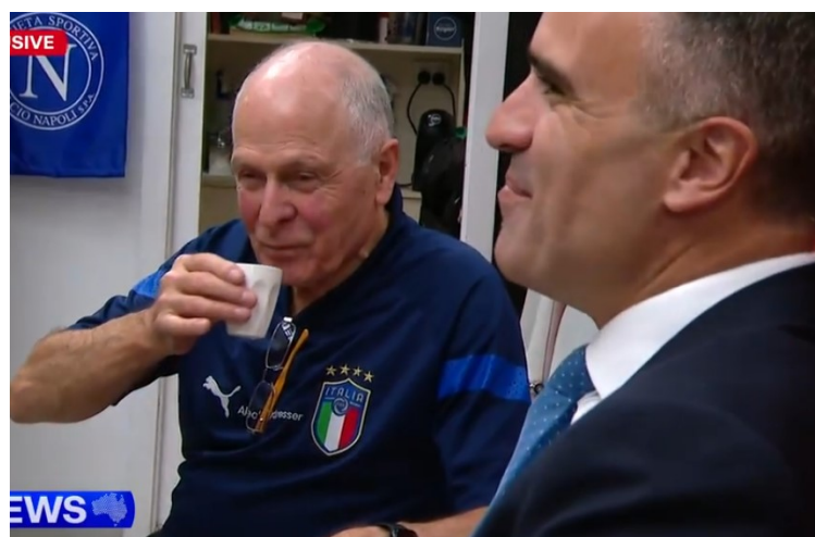
Adelaide barber celebrates 50 years in the job